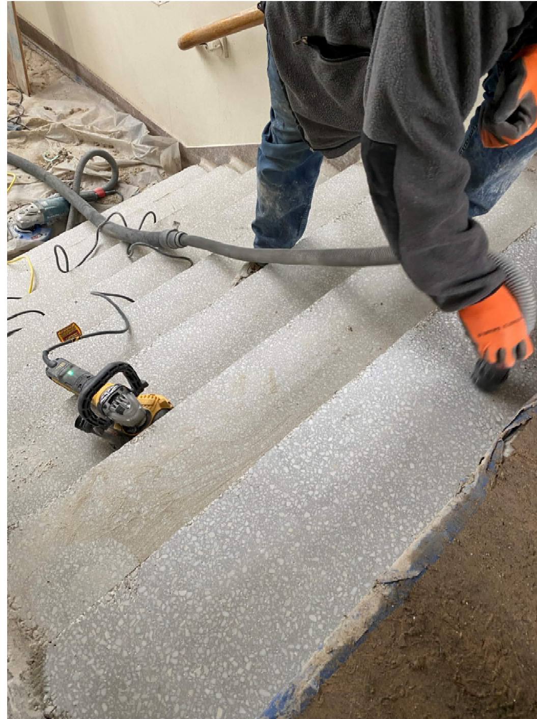
Terrazzo Stair Restoration