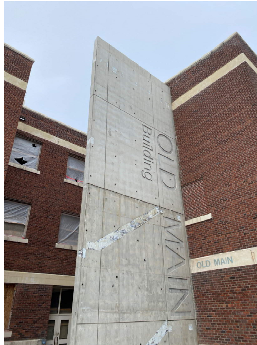
South Stair Tower