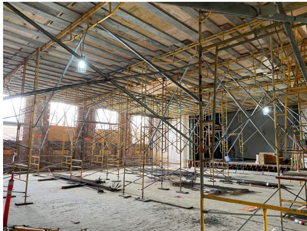
Working Platform at Auditorium